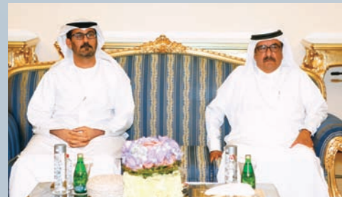
Hamdan bin Rashid Honors 6th Batch of Gifted Diploma Graduates