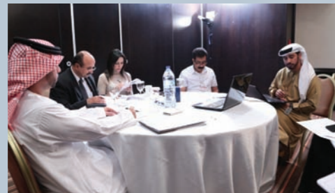
3 Winners from Cambodia, Malaysia and Malawi in UNESCO-Hamdan Prize