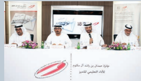
Honoring Ceremony on April 20 Number of Winners Amounts to 275