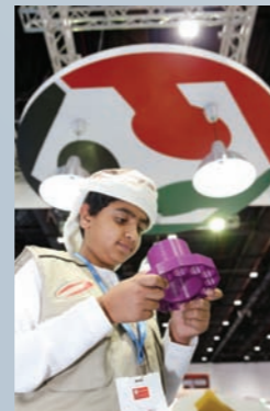
Fab Lab UAE Attracts Visitors to GESS Exhibition